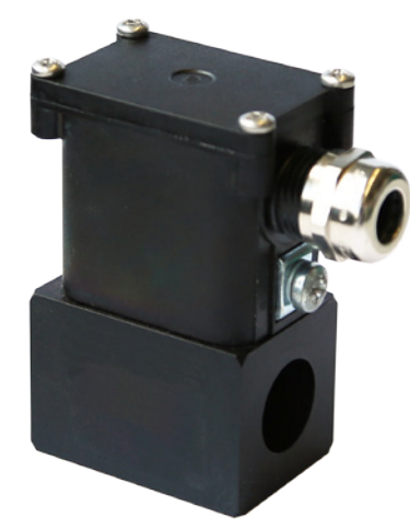
Fig. 1: Type F MM E 035 K01 A01